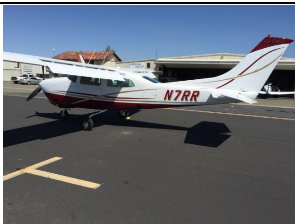
The New "N7RR" (See Editorial)