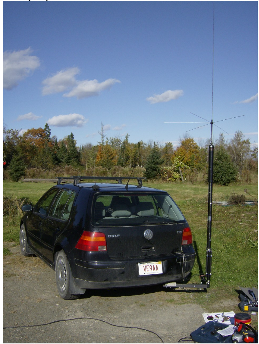
Perhaps my best mobile antenna to date.

Most modern gas cars aren't THAT bad however. You get used to it, and the weaker signals may not hear you anyway, so a little noise is a bit of an equalizer and can be partially helpful not distracting you to the weaker stations you'll tune across and wasting time on calling. You'll get used to not worrying about those 519 stations that usually cannot hear you.