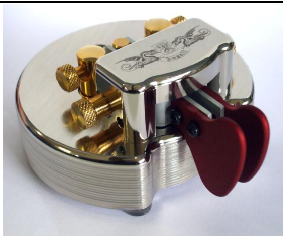
Beautiful Begali Pearl Paddle