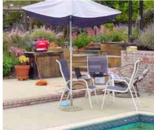
The K6RB Field Day station – hard work, but someone had to do it.