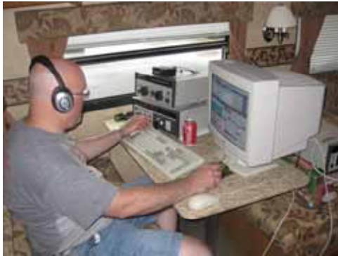
Art, K0RO, operating at N0A-Nixa, MO.