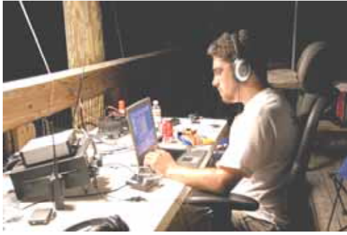
KU5B doing his CW thing at NARS in Houston.