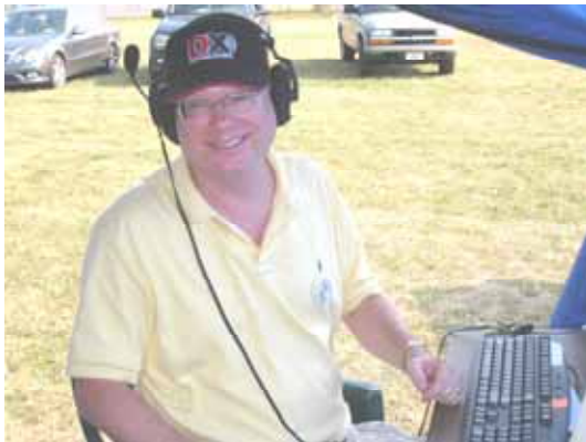
WA2BCK adding points at K4NVA.